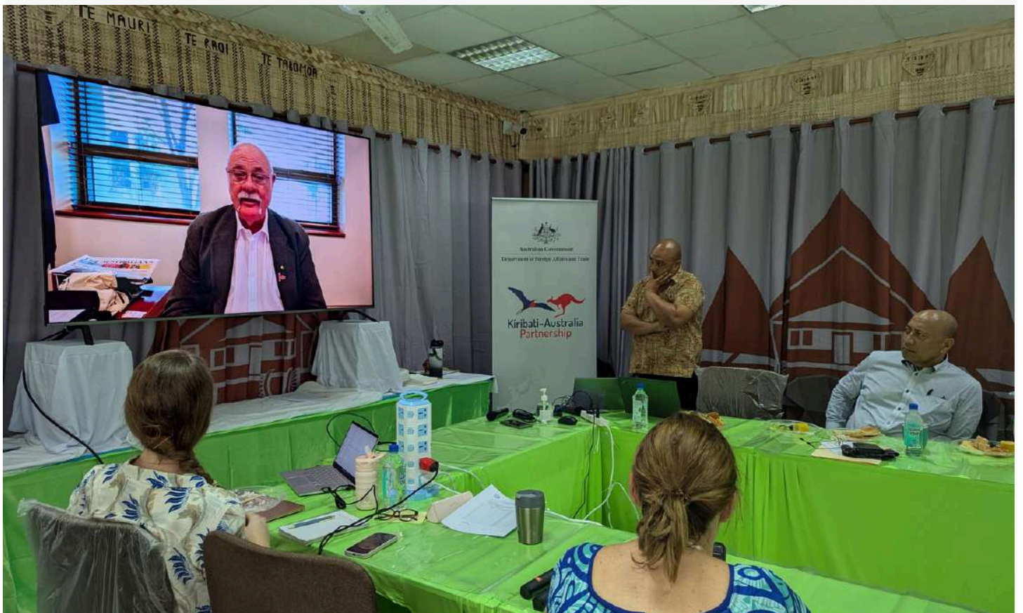
Hon Warren Entsch address to Kiribati

This engagement was particularly critical given the scale of the challenge in Kiribati, where the World Health Organisation estimated a tuberculosis incidence rate of approximately 945 cases per 100,000 population in 2024, among the highest globally.