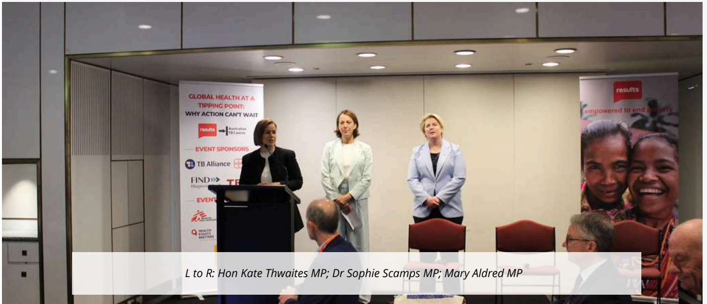
L to R: Hon Kate Thwaites MP; Dr Sophie Scamps MP; Mary Aldred MP

In parallel, Results strengthened parliamentary leadership by relaunching the Parliamentary Friendship Group on Tuberculosis in the 48th Parliament, securing cross-party Co-Chairs Kate Thwaites MP (Labor), Dr Sophie Scamps MP (Independent) and Mary Aldred MP (Liberal). This group provides an important platform for shining a light on the devastating nature of tuberculosis and sustaining vital funding investment.